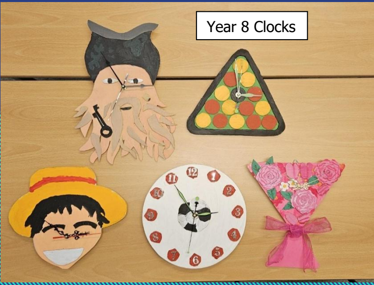
Year 8 Clocks